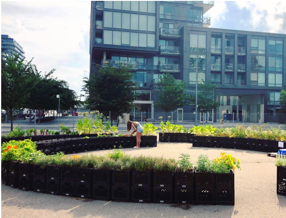
Block 10 - Canary District - Dream/Kilmer/Tricon/AHT - 2019/2020