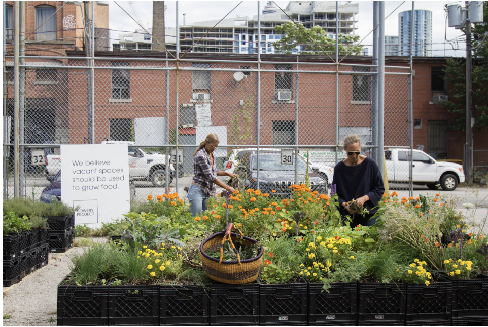
2 Tecumseth - TAS Design - 2018/2019/2020