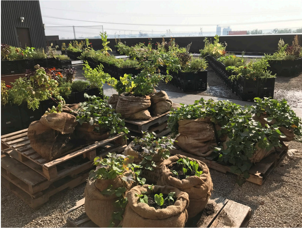
EDIT Design Exchange Festival - 2017