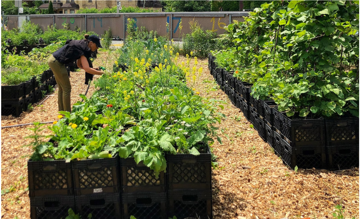
307 Sherbourne - Oben Flats - 2016/2017/2018/2019